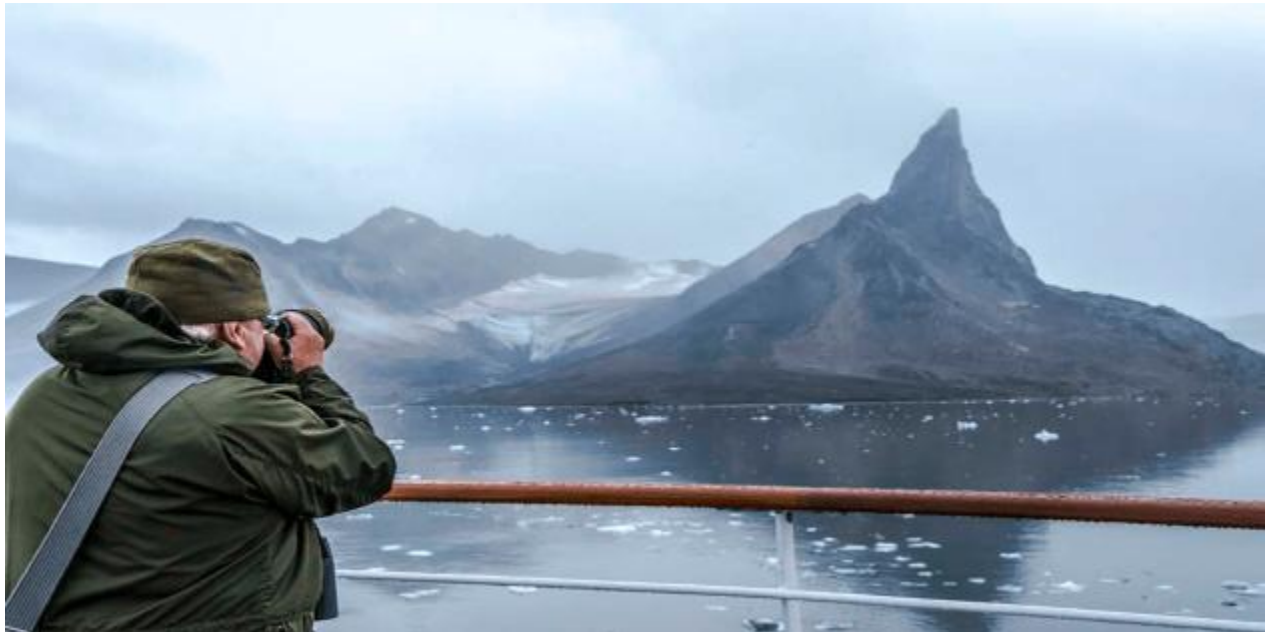
Majestic mountains and wonderful wildlife