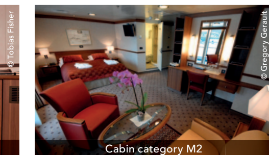
Cabin category M2