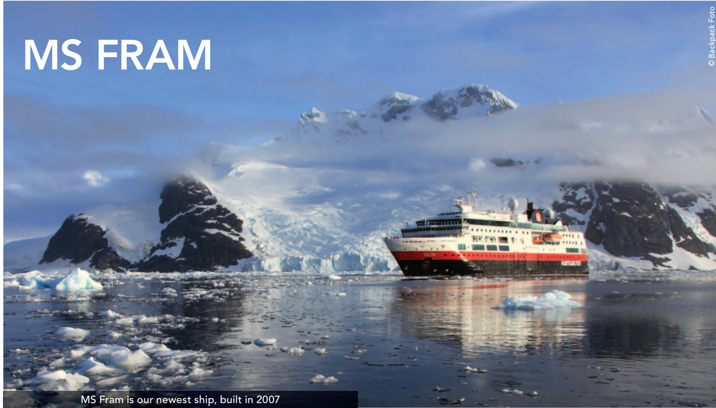
MS Fram is our newest ship, built in 2007