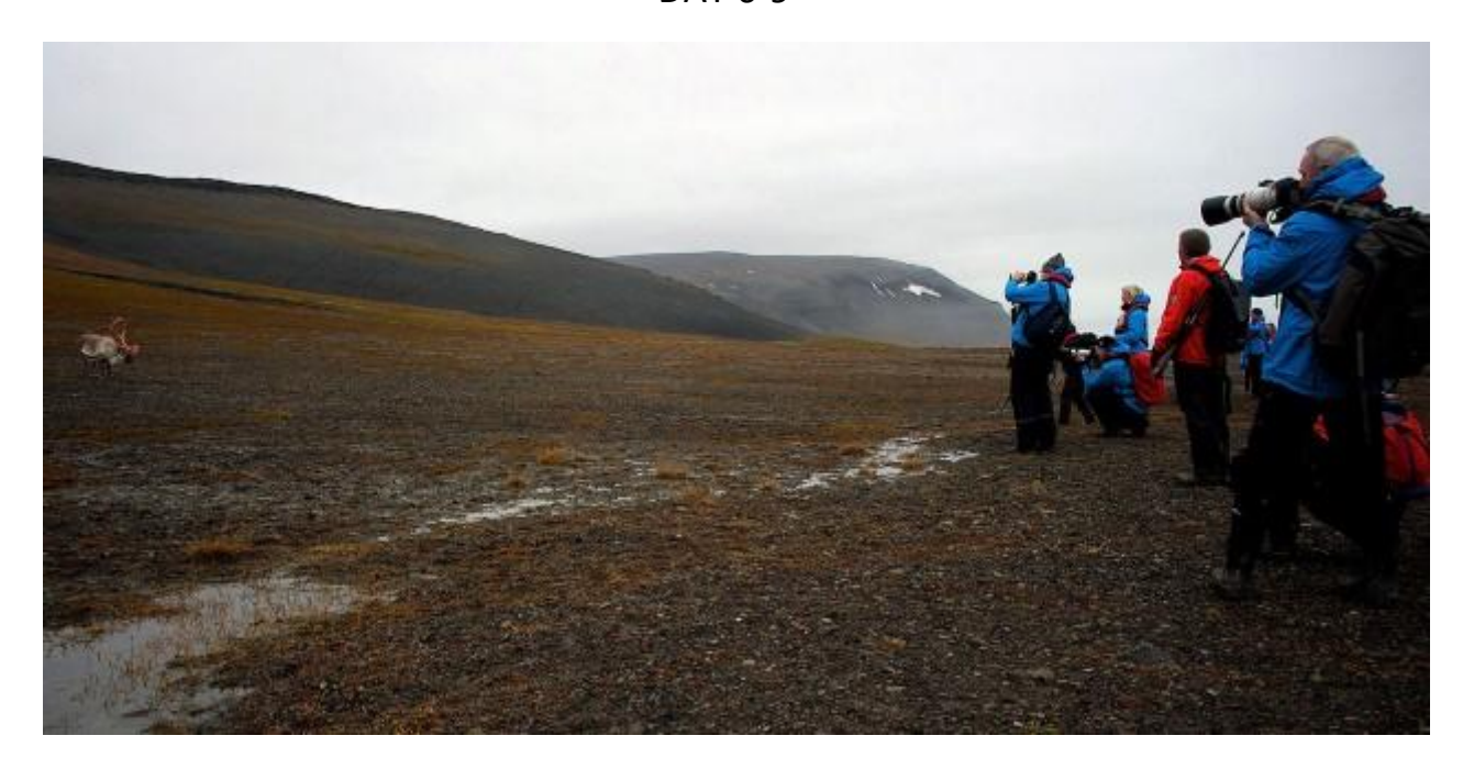
Where conditions are extreme and the land is barren