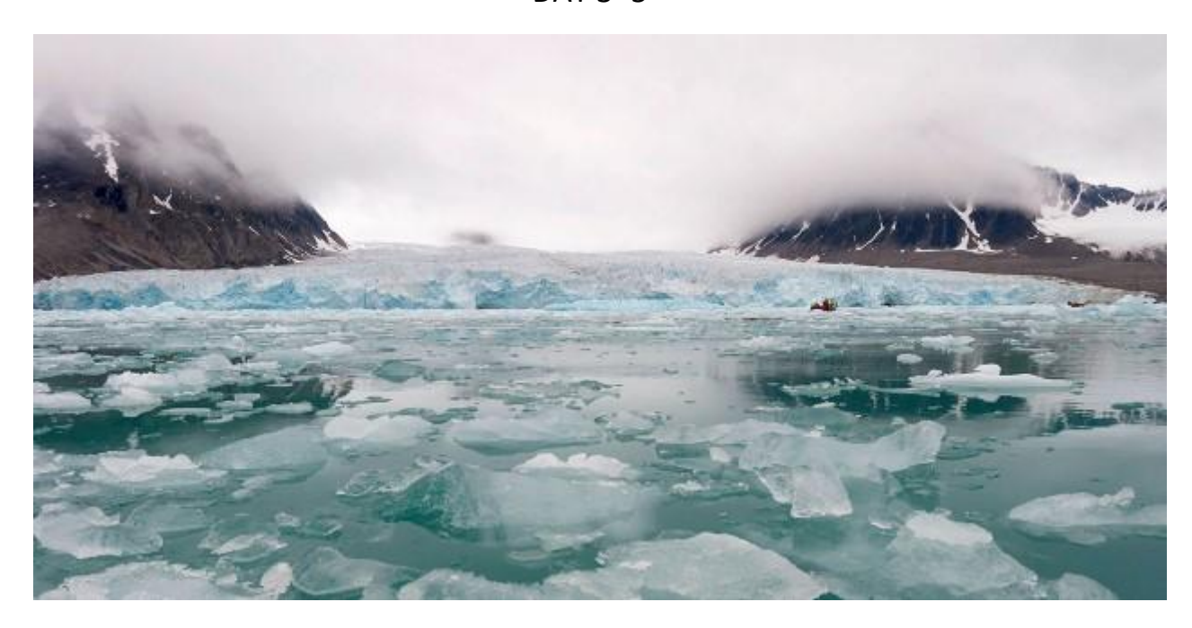
Mighty glaciers, deep fjords and amazing mountains

Location: North West Spitsbergen National Park