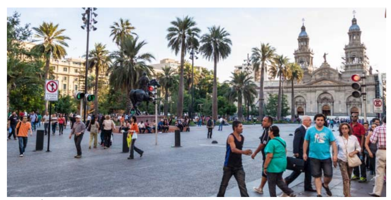
Taste of Santiago