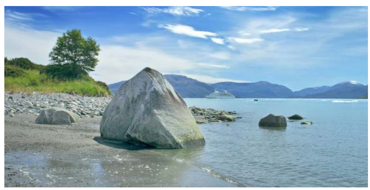
Incredible seaside views

Location: Chilean fjords / Tierra del Fuego