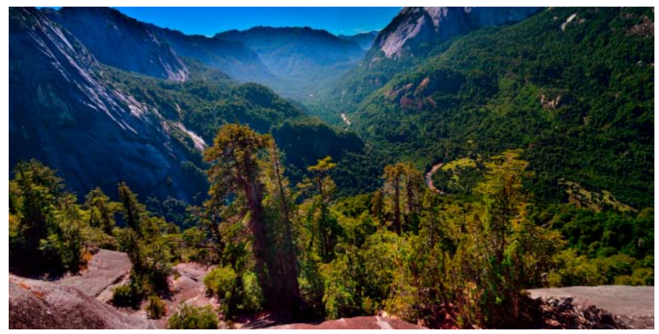
Southernmost point of South America

Location: Chilean fjords / Tierra del Fuego