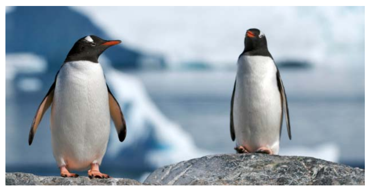
Feel like a real explorer