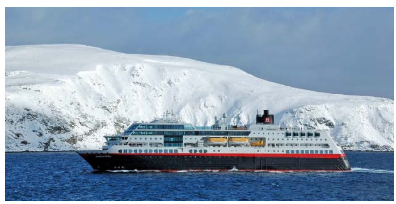
Crossing the famous Drake Passage