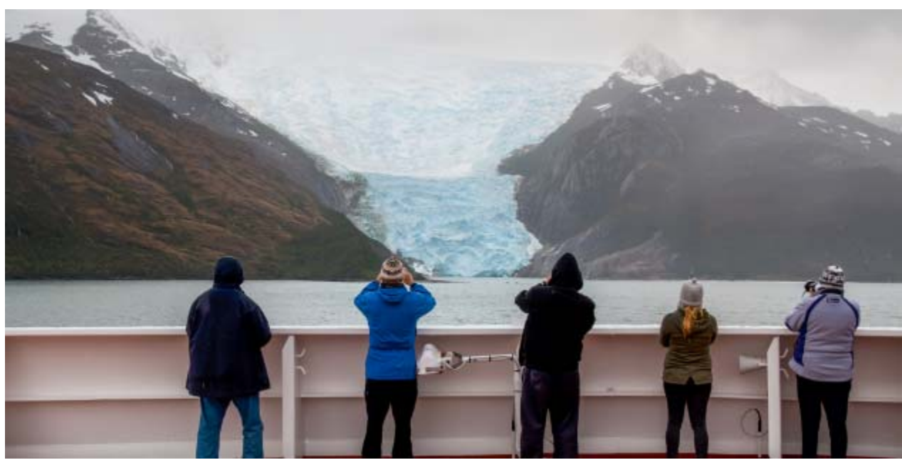
Wild nature and impressive sights