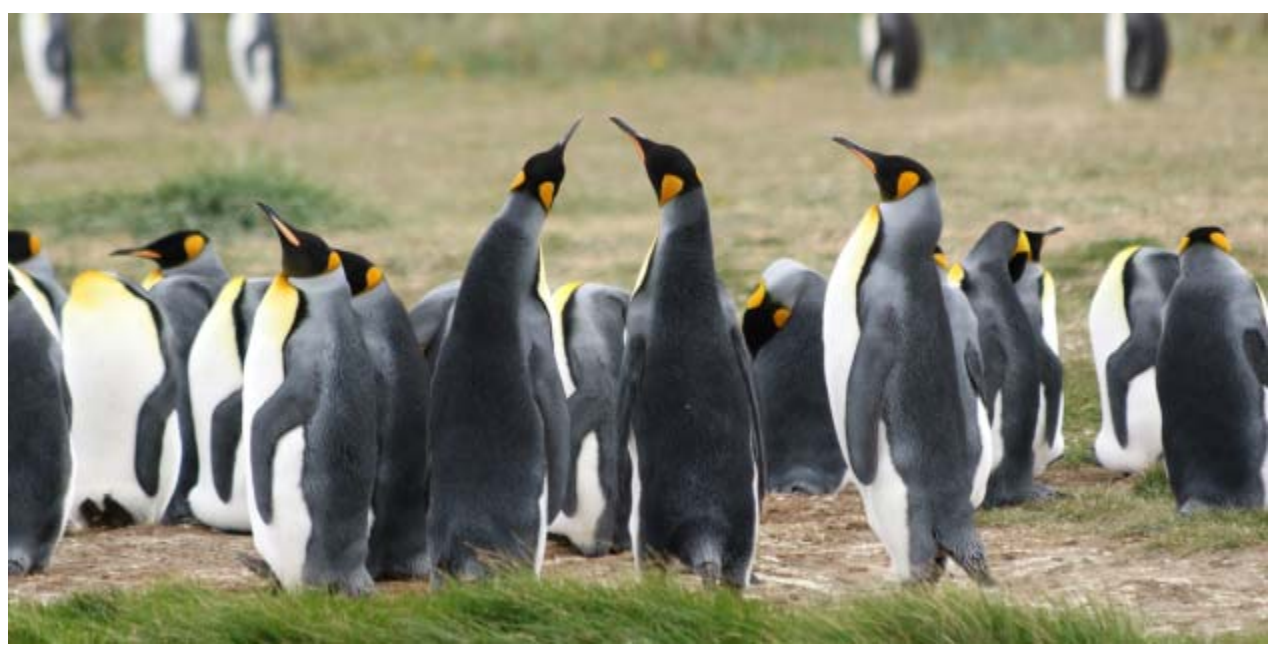
Wildlife and wine tasting

Location: Chilean fjords / Tierra del Fuego