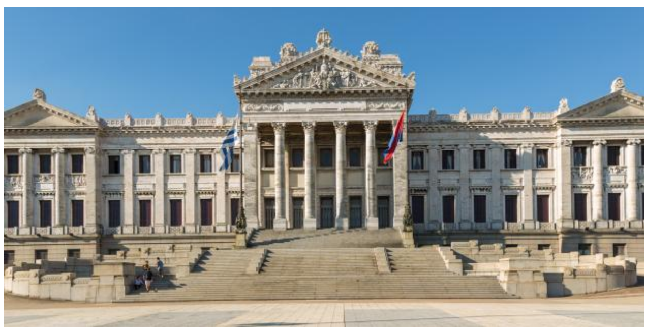
The end of the expedition