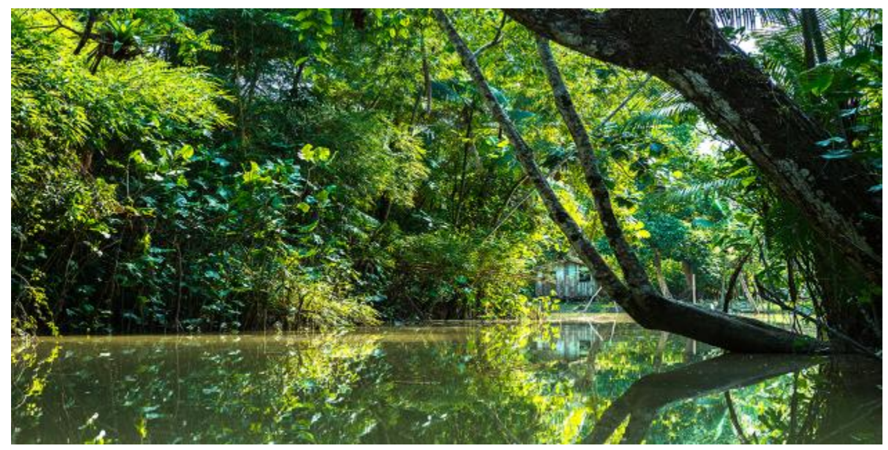
From the Amazon to the Atlantic